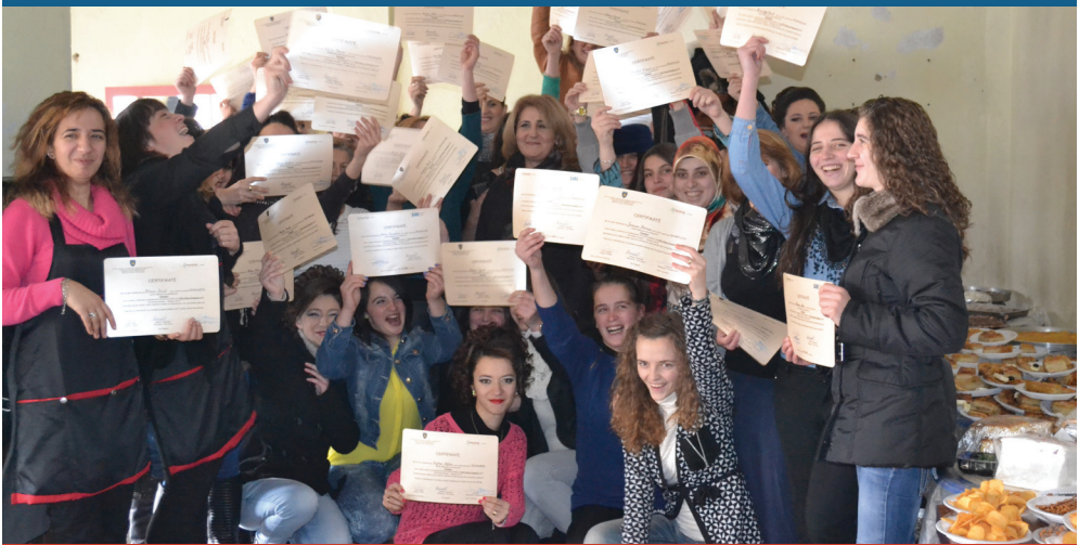
Picture 5. OG members after competency test, celebrating certification

To ensure quality of the trainings certification of the hairdressing at the end of the training, this was done in collaboration with vocational training centre (VTC). An experienced trainer appointed by VTC monitors the training regularly and at the end of the training conducts a competence test. Then, a certificate recognised nationally is issued. In occupations where VTCs have not developed training modules, competency test was carried out by trainers of other opportunity groups.