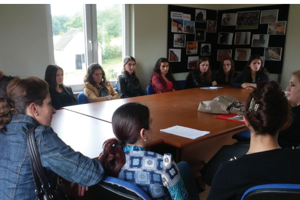
Picture 3. Training provider discussing with opportunity group members training location and training objectives